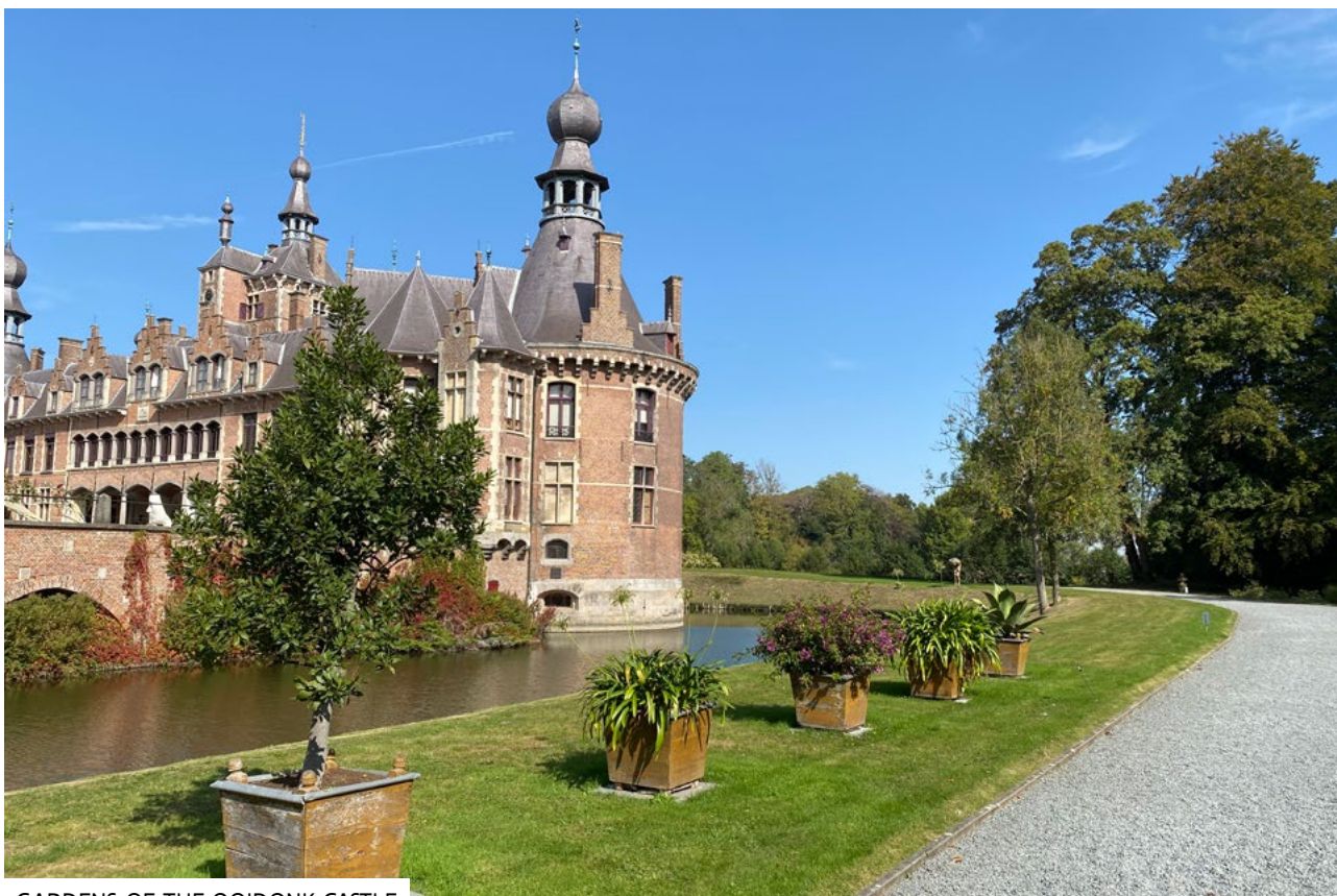
GARDENS OF THE OOIDONK CASTLE