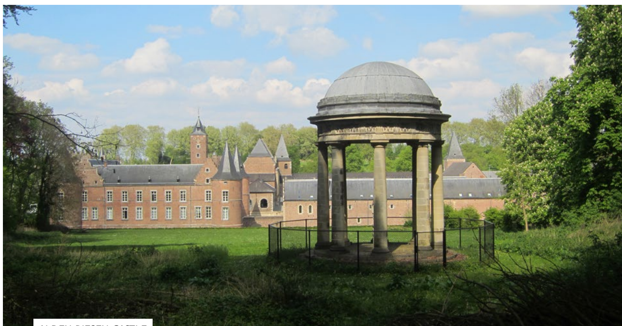
ALDEN BIESEN CASTLE