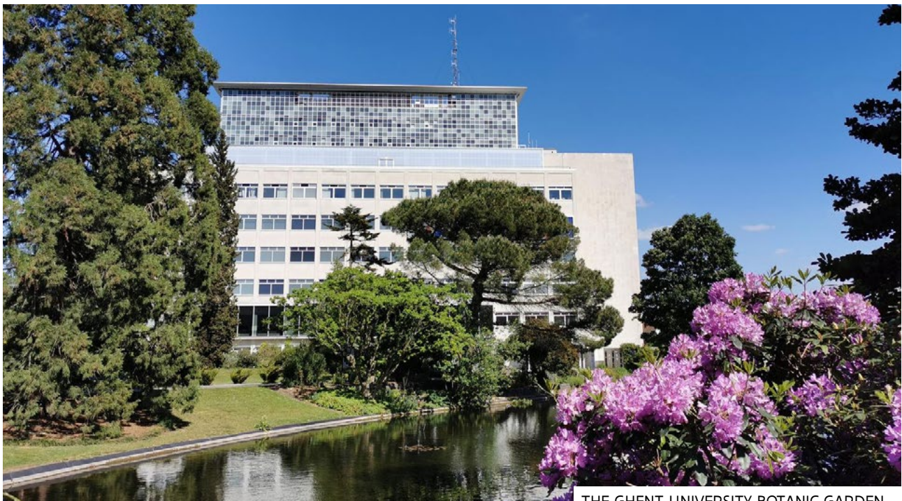
THE GHEENT UNIVERSITY BOTANIC GARDEN