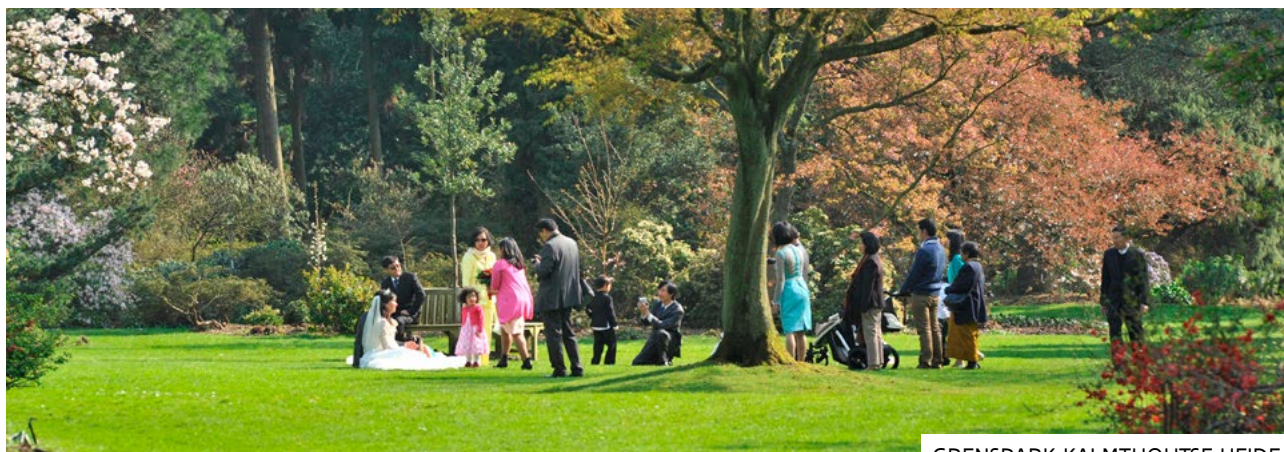
GRENSPARK KALMTHOUTSE HEIDE